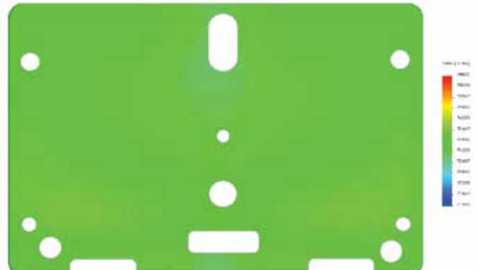
Figure 3: Example of application with customized profiled heater.

Disclaimer: Data presented for informational purposes only. Actual values and/or usage is for reference.